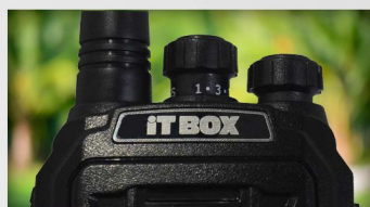
High Quality & Durability