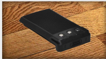
2000 mAh Long Lasting Battery