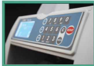
Easy & Clear Number Pad