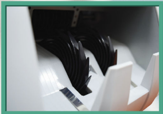
Large Capacity Stacker Storage