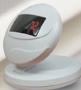
Fashion External Display Come with