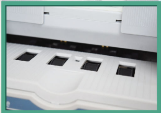
4 Quality Feeder Roller