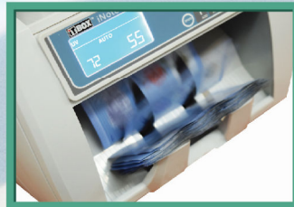
Speed & Accurate