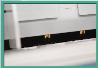
Long Lasting Copper Head Feeder