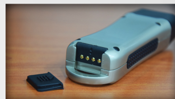
Charge/Connect By USB Pogo Pin Connector Data