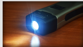
5 Mode Power LED Torch Lights