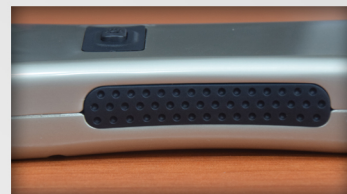
Double Silicone Block For Anti Slide