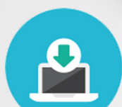
High Speed Download