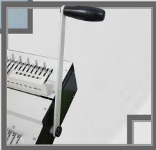
2 handle ~ Punching Handle