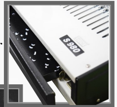
Scrap Paper Drawer