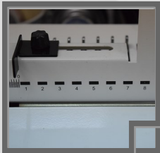
Punching Hole Measurement, more Accuracy