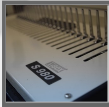
24 Dies, Tempered Steel and Individually Releasable