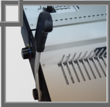
2 Handle ~ Binding Handle