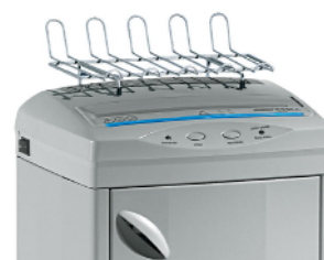
Computer forms top shelf to save office space (Space Saving Design)