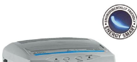
"ENERGY SMART" Management system for power saving stand-by mode