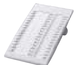
■ KX-T7740 DSS Console