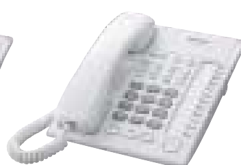
■ KX-T7750 Monitor Unit