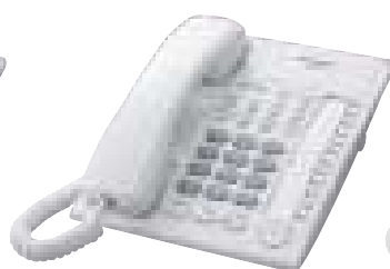
■ KX-T7720 Speakerphone Unit